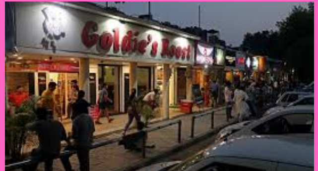
Explore the Food Vibe: Sector 8