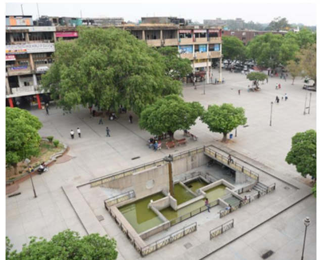
Figure : Commercial Plaza, Sector 17, Chandigarh