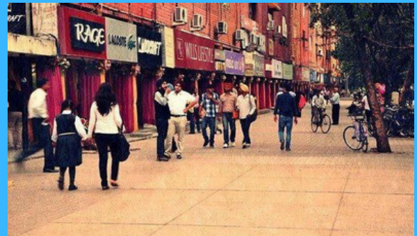
Explore the Heart of the City: Sector 17