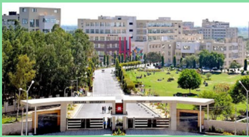
Departure from the University