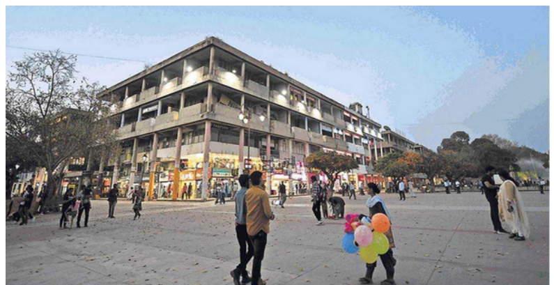
Figure : Public Space, Sector 17, Chandigarh