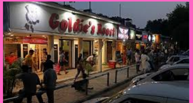
Explore the Food Vibe: Sector 8